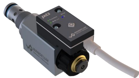
Valve with IO-Link electronics (PD3)