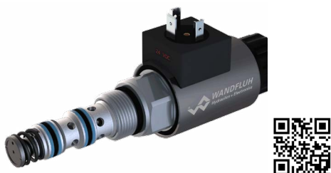
The smaller all-in-one proportional valve QSPPU10_25