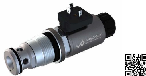
The larger all-in-one proportional valve QSPPM33_80